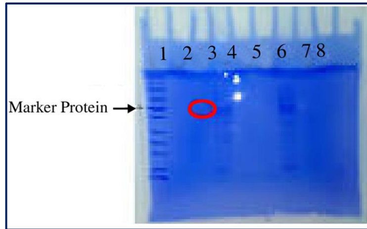
Figure 4: SDS-PAGE of bacteriocin separated from Lactobacillus sp (GG1)

starter cultures for traditional fermented foods, with a view to improving the hygiene and safety of the food products so produced.